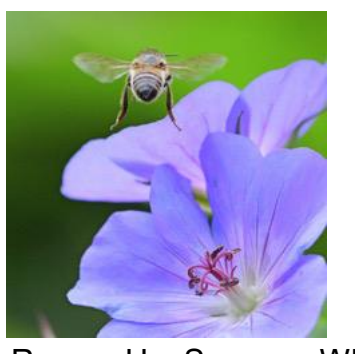
Macro Runner Up: Seymour White